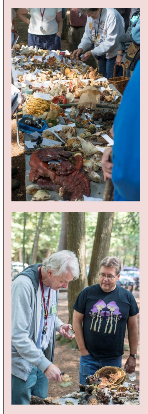
From the joint CVMS-BMC foray